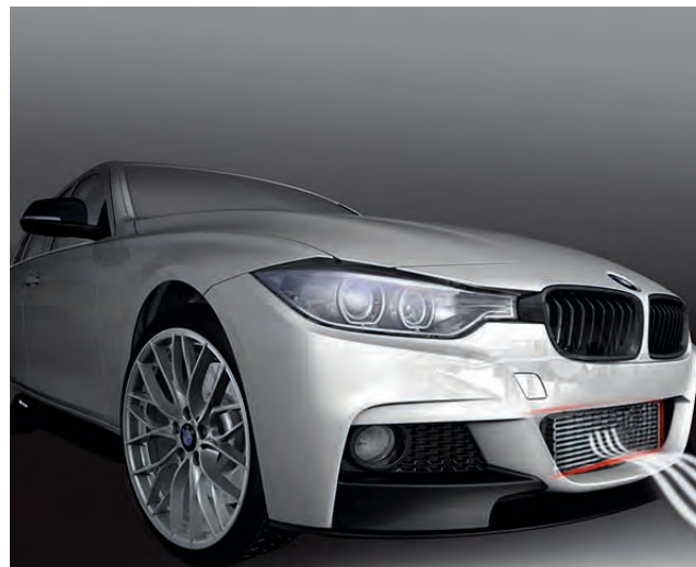
Performance data for the BMW 120d/320d with BMW M Performance Power Kit Full load 120d/320d

the selected gear. The performance increase, brought about by engine data modifications, introduces new thermal challenges. This is why, as well as a new control unit that processes the data, there is a larger intercooler. Only with the Original BMW M Performance Power Kit does the BMW warranty remain unaffected. Available for the following engine variants: 120d and 320d and, from 12/2012, the 335i. The BMW M Performance Power Kit includes the BMW M Performance logo.